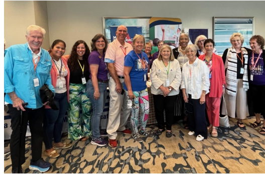
Unified Voices Summit in support of protecting educational freedom in Florida, July 12-13