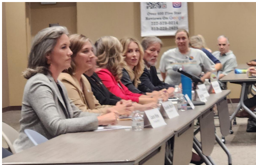
School Board Candidate Forum , presented by LWV North Pinellas, July 22