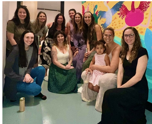
Parent Advocacy League, LWVSPA, July 27