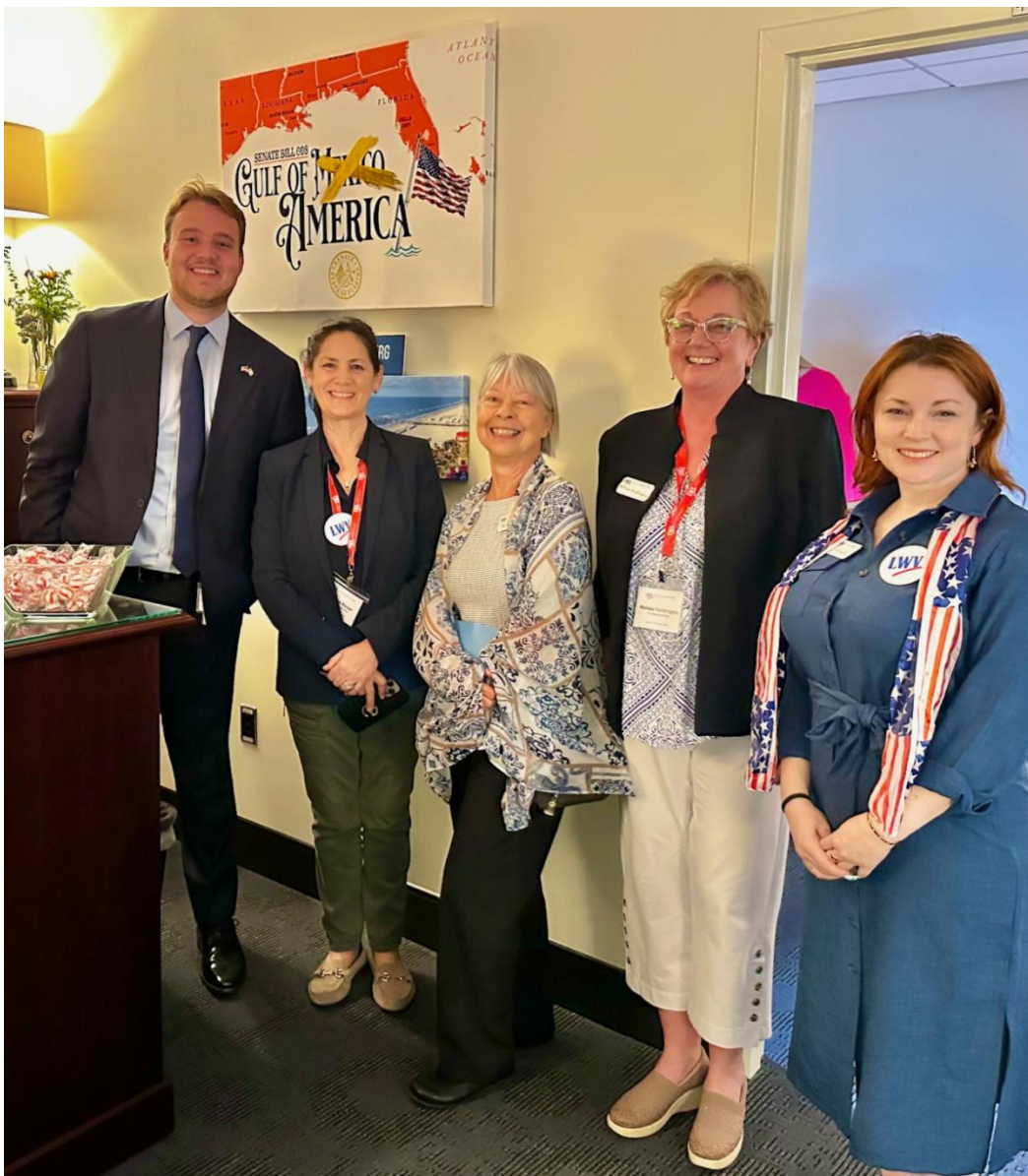
LWVSPA members meet with State Senator Nick DiCeglie's