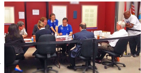
Vote canvassing at the SOE Office last fall.