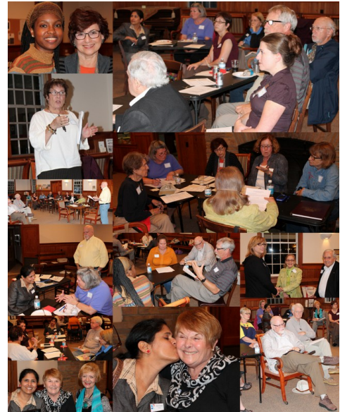
2014 Program Planning Meeting

Please join us for this very important meeting to plan our League's work for the upcoming League year. A light supper and beverages will be provided.