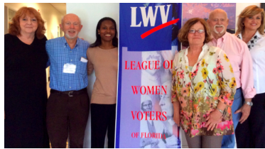
Last year's Legislative Summit group

Essentially our "lobby days," the League of Women Voters of Florida's annual Legislative Summit brings members from all over the state to Tallahassee to advocate on our issues before state leaders, ensuring that a strong and united League voice is heard. Previously dubbed Legislative Seminar, this three-day conference during legislative session has in the past included seminars and trainings on understanding League positions and advocating with civility, briefings with legislative leaders in the Cabinet Room of the Florida Capitol, lobbying legislators in person, members-only formal luncheons and