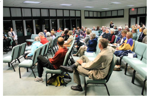
Hot Topics Presentation Audience

Our Hot Topics presentation at the Poynter Institute on January 27th was a great success! The LWVSPA Immigration Working Group was very persistent in getting the word out in their neighborhoods and extending personal invitations to friends. Our presenters also sent out notices via their email lists. As a result, 95 people attended our educational forum: Refugees-- Across the Globe and Close to Home in Tampa Bay. The four very experienced and knowledgeable panelists covered the topic from a world view, across Florida, and then close to home, with an emphasis on the process to seek asylum status and its success rate for adults and unaccompanied children. Their presentations were followed by a lively question and answer session.