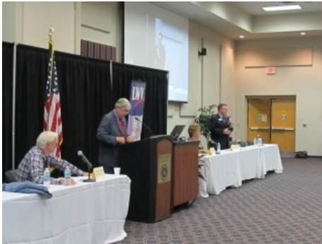
A candidate forum during the last election cycle