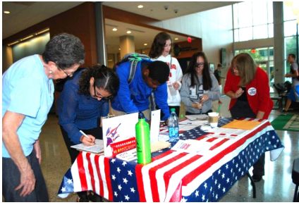
Voter registration at USF

Our Voter Registration Drive is from January 15th through February 10th, prior to municipal elections and the U.S. Congressional District 13 Special General Election on March 11th. Please consider lending a hand in this very important effort. We guarantee a rewarding experience!