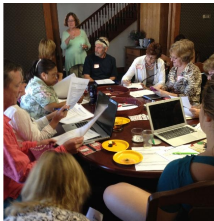
New members participate in a League "Scavenger Hunt" at our latest New Member Orientation