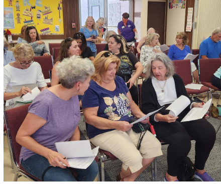
Forty-three eager supporters attended the first meeting. As of 5/28/23, 80 people have joined the team. All are welcomed!!