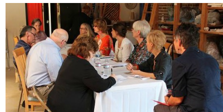
Participants at a previous Member Orientation