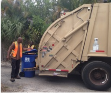
Alley pickup started on Jan. 25th.

collected in January was down from the holiday-driven December, but exceeded the monthly tonnage of of August thru November.