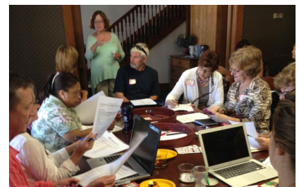
The group at a recent member orientation.

Parking is available on street or behind the building.