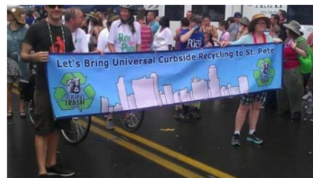
PRIDE Parade 2013

Become informed and help make recycling a success in St Petersburg! Email me at kcoale@lwwspa.org .