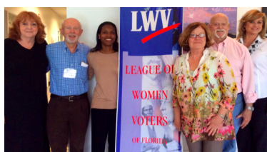
Last year's Legislative Summit group.

Essentially our "lobby days," the League of Women Voters of Florida's annual Legislative Summit brings members from all over the state to Tallahassee to advocate on our issues before state leaders, ensuring that a strong and united League voice is heard. Previously dubbed Legislative Seminar, this three-day conference during legislative session has in the past included seminars and trainings on understanding League positions and advocating with civility, briefings with legislative leaders in the Cabinet room of the Florida Capitol, lobbying legislators in person, members-only formal luncheons and dinners, and fundraising galas with Florida leaders.