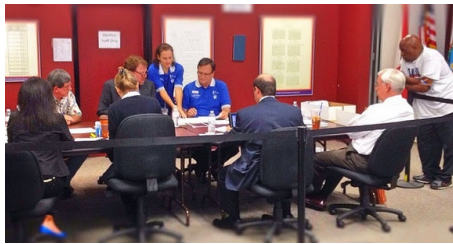
A CB in action.

In anticipation of very thin margins of victory for some of the state and local races in this past month's general election, the League felt that local canvassing boards' decisions were critically important and that there was a heightened need for outside observation.