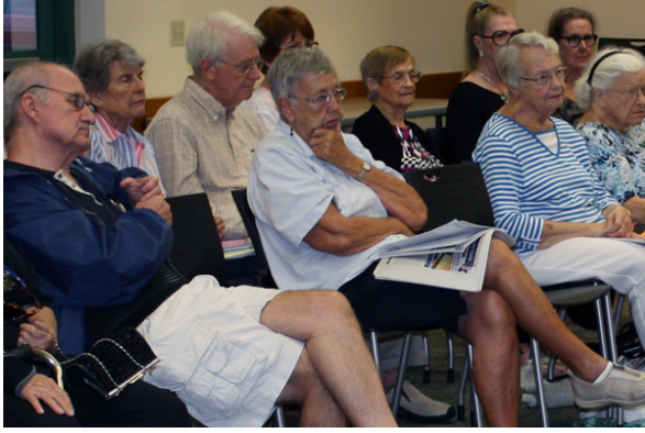
LWVSPA and LWNPA participants at the September 8th IR Meeting.